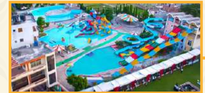
Diamond Aqua Water Park