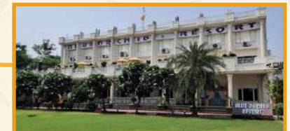
Blue Orchid Resort